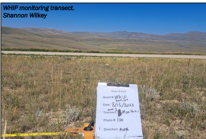
WHIP monitoring transect.

CVA will be sponsoring three (3) Spray Days again this year, in partnership and coordination with the Beaverhead County Weed District. At Red Rock Pass, Lima Dam, and Wolverine Spray Days, all in August, CVA will provide a homemade lunch, dessert, and drinks to those who come and participate for the day! A full list of Spray Days in the area are provided below. CVA will also be leading four Weed Weeks this summer and early fall, which allows staff to intensively target noxious weed infestations throughout the Centennial Valley. Weed Weeks are scheduled for June 24-28, July 15-19, August 12-16, and September 16-20. We hope you will join us at one or more community Spray Days or at a Weed Week this year!